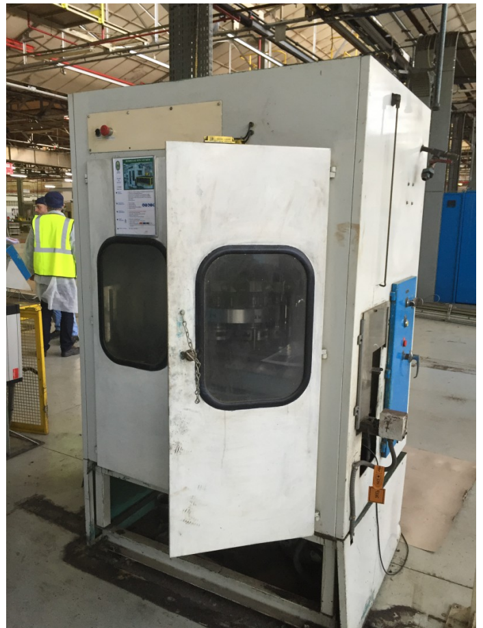
Metal Box 86D spin flanger CPN 4335 - Page 2 of 3