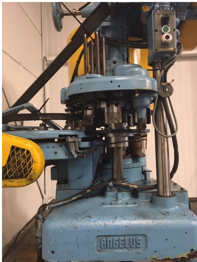
Angelus 60L seamer CPN 4292 - Page 4 of 4