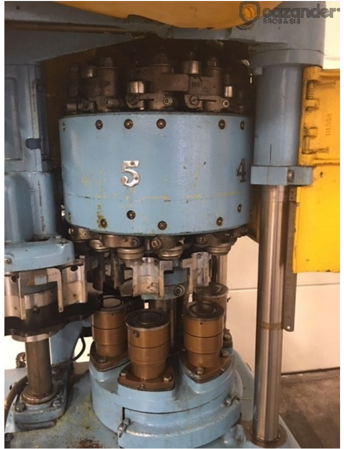
Angelus 60L seamer CPN 4292 - Page 2 of 4