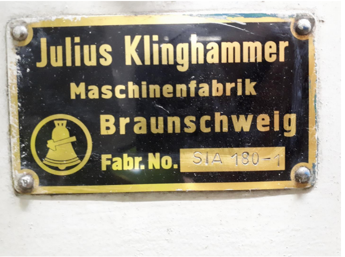
Klinghammer SIA 180 beader CPN 5609 - Page 3 of 3