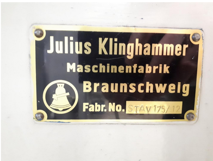
Klinghammer STAV 175 flanger - seamer CPN 5607 - Page 2 of 2