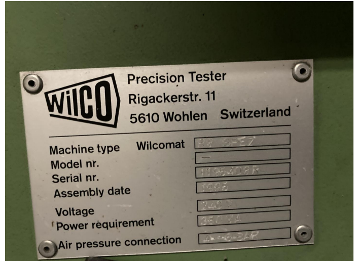
Wilco R 8 SPEZ tester CPN 5576 - Page 2 of 2