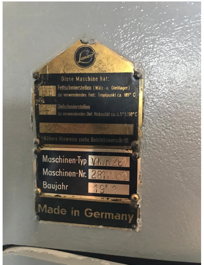
Lanico VMR 281 seamer semi~auto CPN 5575 - Page 2 of 2