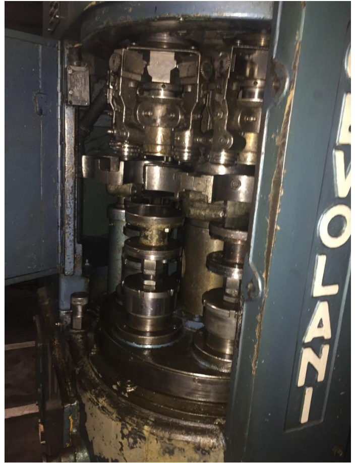
Cevolani AT 78 seamer CPN 5539 - Page 2 of 3