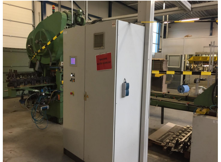
Naroska STAI-4ST forming press CPN 5490 - Page 3 of 4