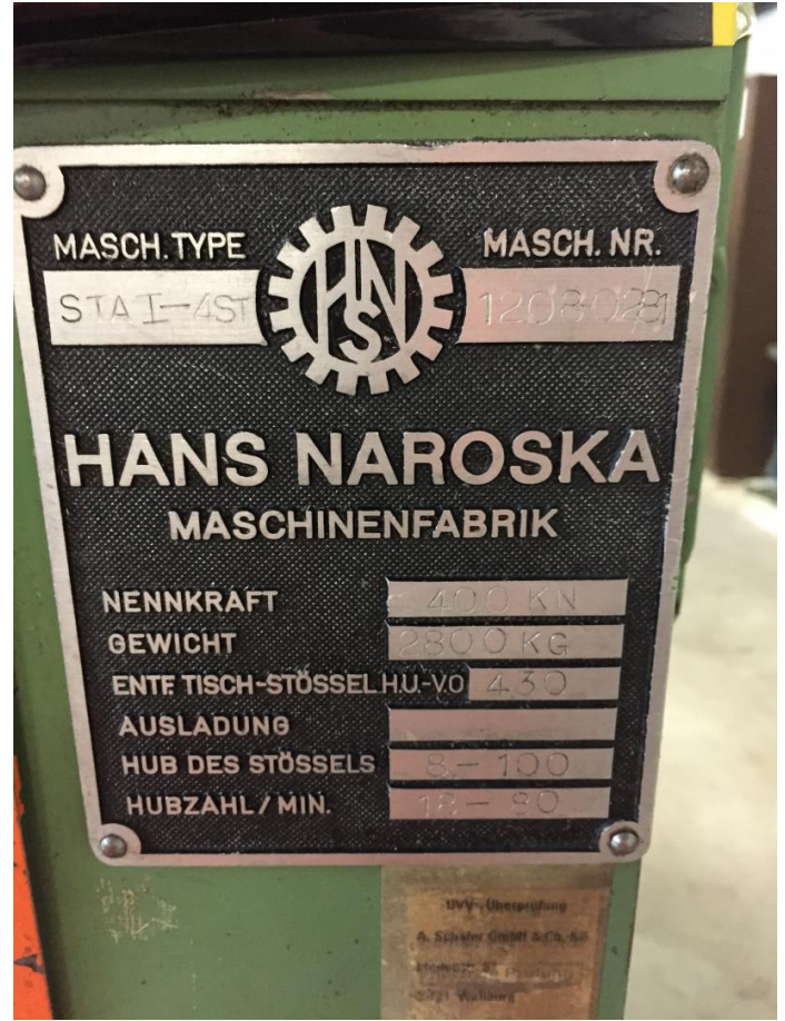
Naroska STAI-4ST forming press CPN 5490 - Page 2 of 4