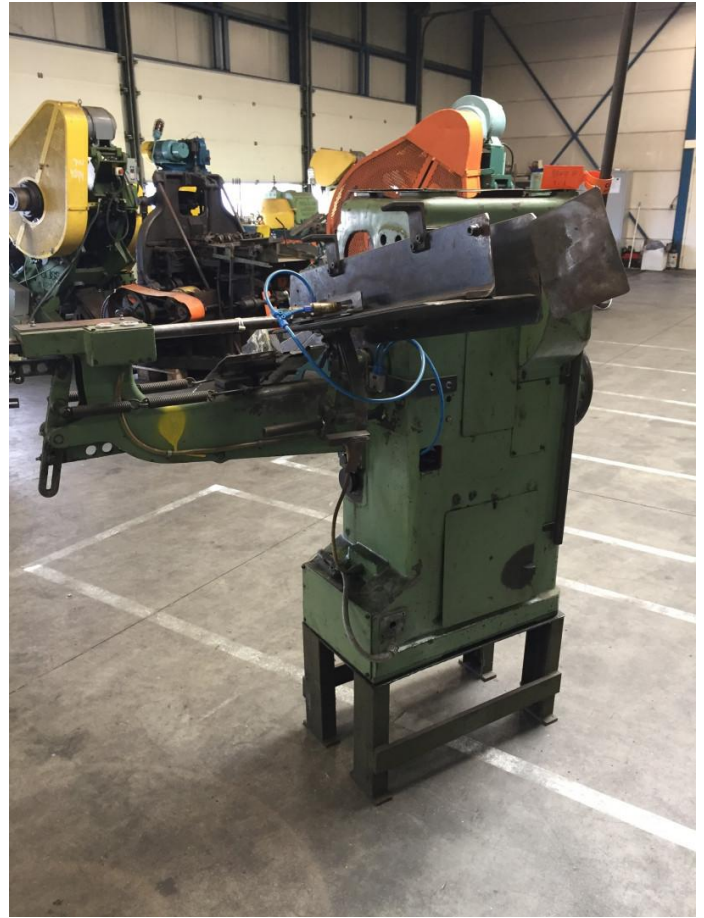
Kircheis Krupp GDNb thread roller CPN 5488 - Page 2 of 3