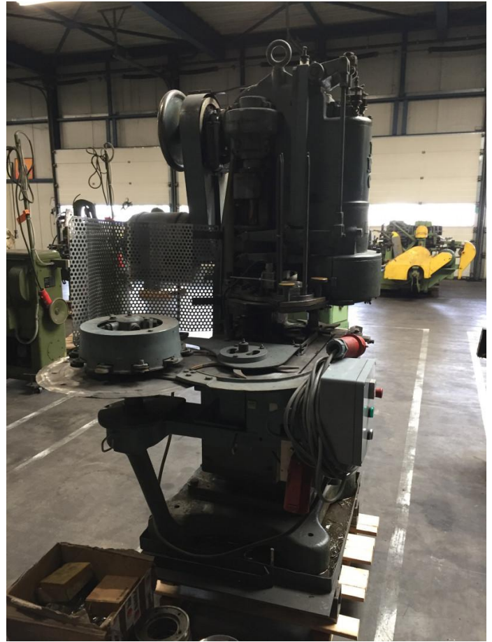
IMC 178 seamer CPN 5481 - Page 2 of 3