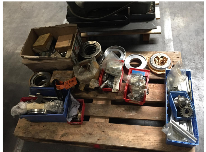
IMC 178 seamer CPN 5481 - Page 3 of 3