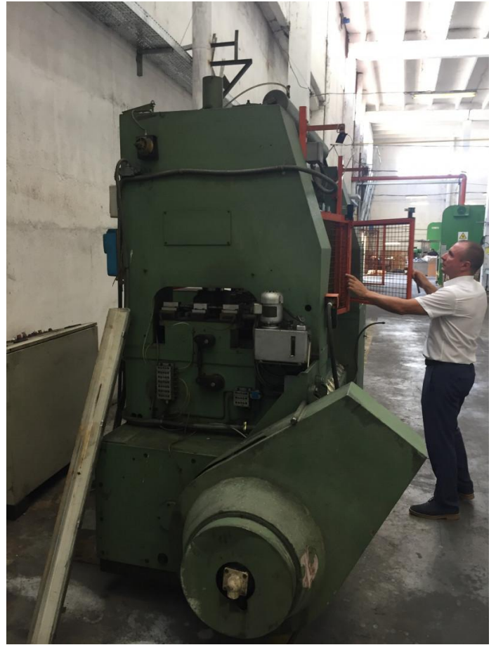
Benelli transfer press CPN 5372 - Page 2 of 3