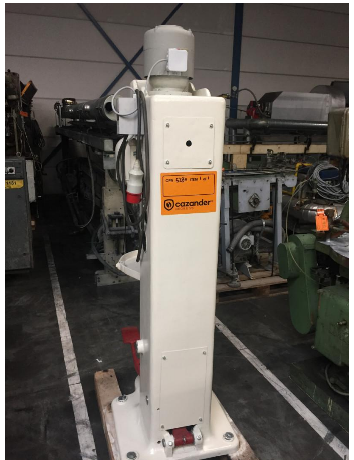
Lanico Rapid seamer semi~auto CPN 5280 - Page 2 of 2