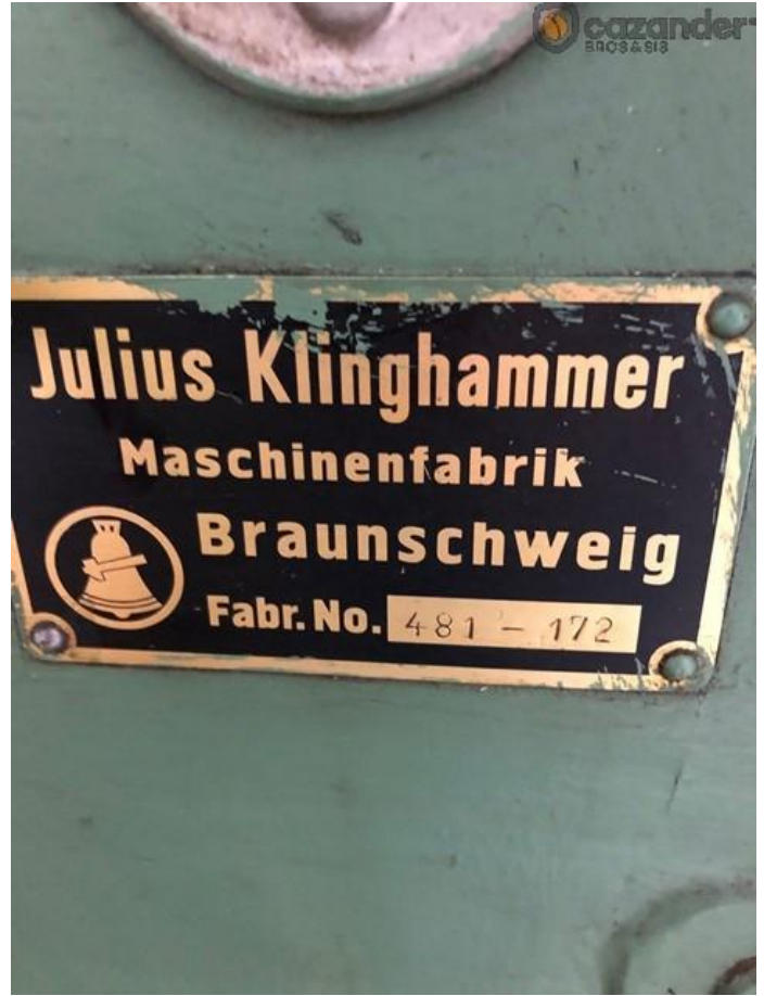
Klinghammer 481 flanger CPN 5203 - Page 4 of 4