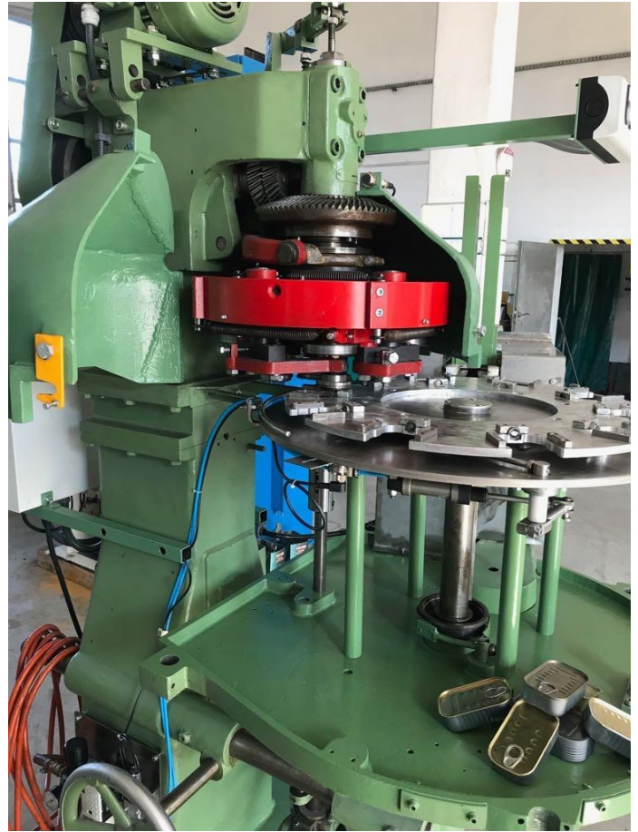
Klinghammer 438 seamer CPN 5200 - Page 2 of 3