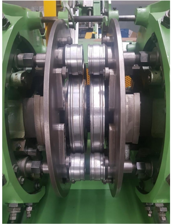
Shin-I S-B17SL beader CPN 5193 - Page 2 of 3