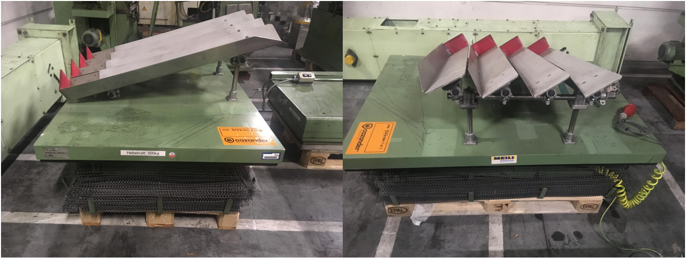
Meili EVL5 stacking unit - lift table CPN 5177 - Page 3 of 3