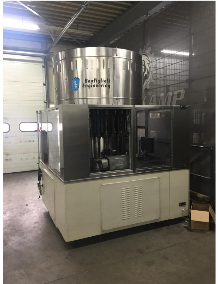
Bonfiglioli KBA 09024 tester CPN 5158 - Page 2 of 4