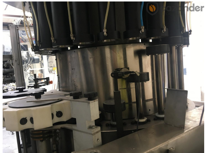
Bonfiglioli KBA 09024 tester CPN 5158 - Page 3 of 4