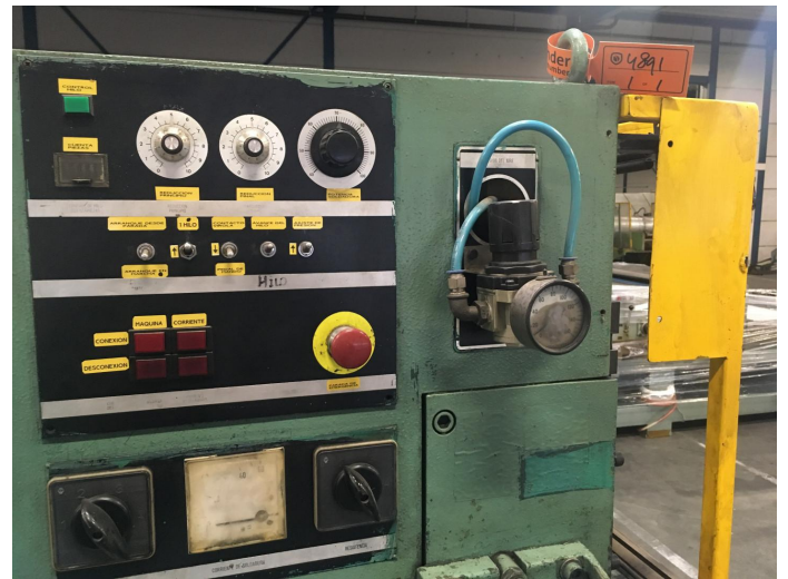
Soudronic NRZd 12/AE bodymaker welder CPN 4891 - Page 2 of 3