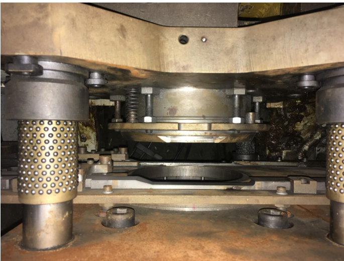
Karges Hammer ASts 230 stripfeed press CPN 4774 - Page 2 of 2