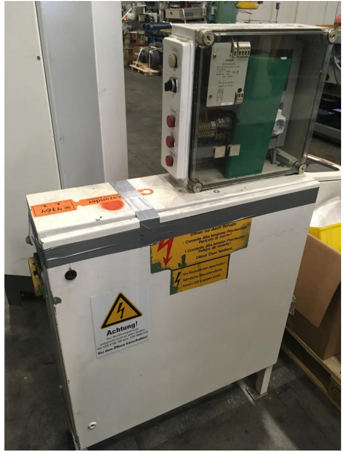
Continental Can 450-HCM-4 seamer CPN 4764 - Page 3 of 3