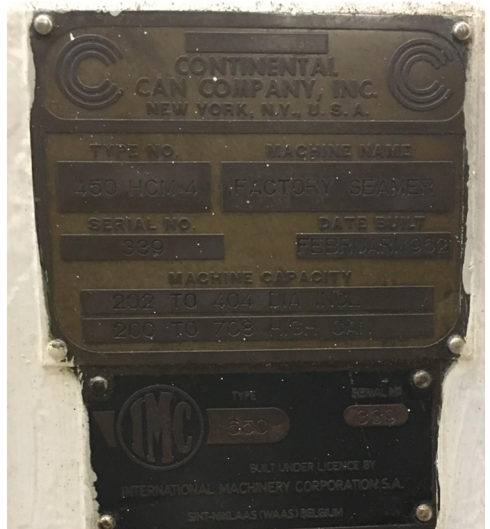
Continental Can 450-HCM-4 seamer CPN 4764 - Page 2 of 3