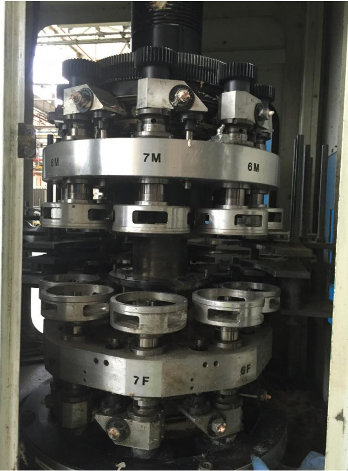
Metal Box 86D spin flanger CPN 4335 - Page 3 of 3