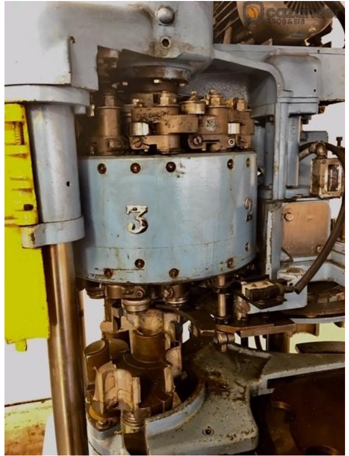
Angelus 60L seamer CPN 4291 - Page 2 of 3