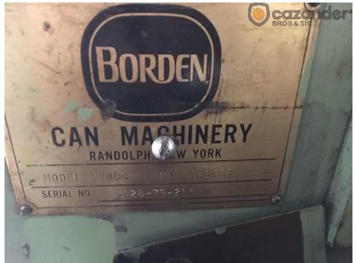
Borden 180 B-80 tester CPN 4200 - Page 2 of 3