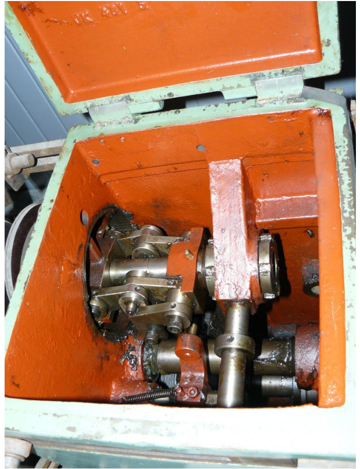
Klinghammer 481 flanger CPN 3068 - Page 2 of 3