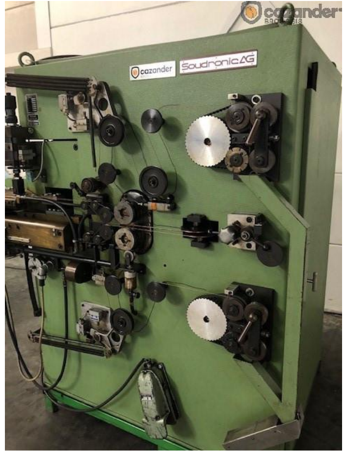
Soudronic NRZD 20 E bodymaker welder CPN 3023 - Page 2 of 5